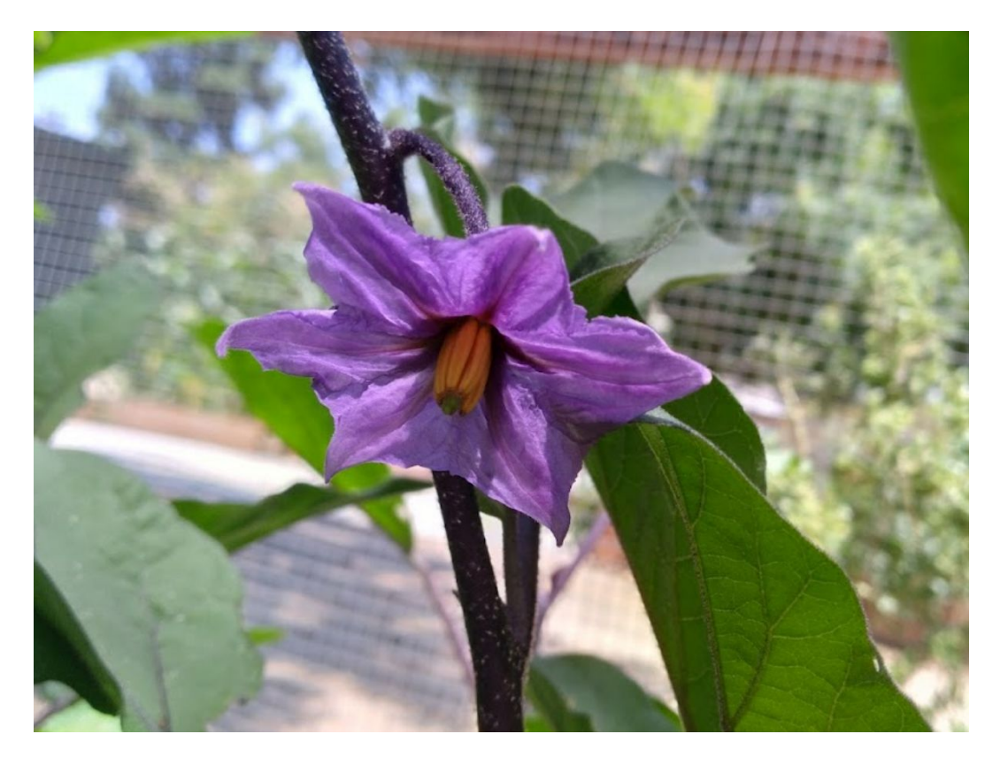
Welcome to our UCCE Master Gardeners of San Bernardino County Monthly Newsletter