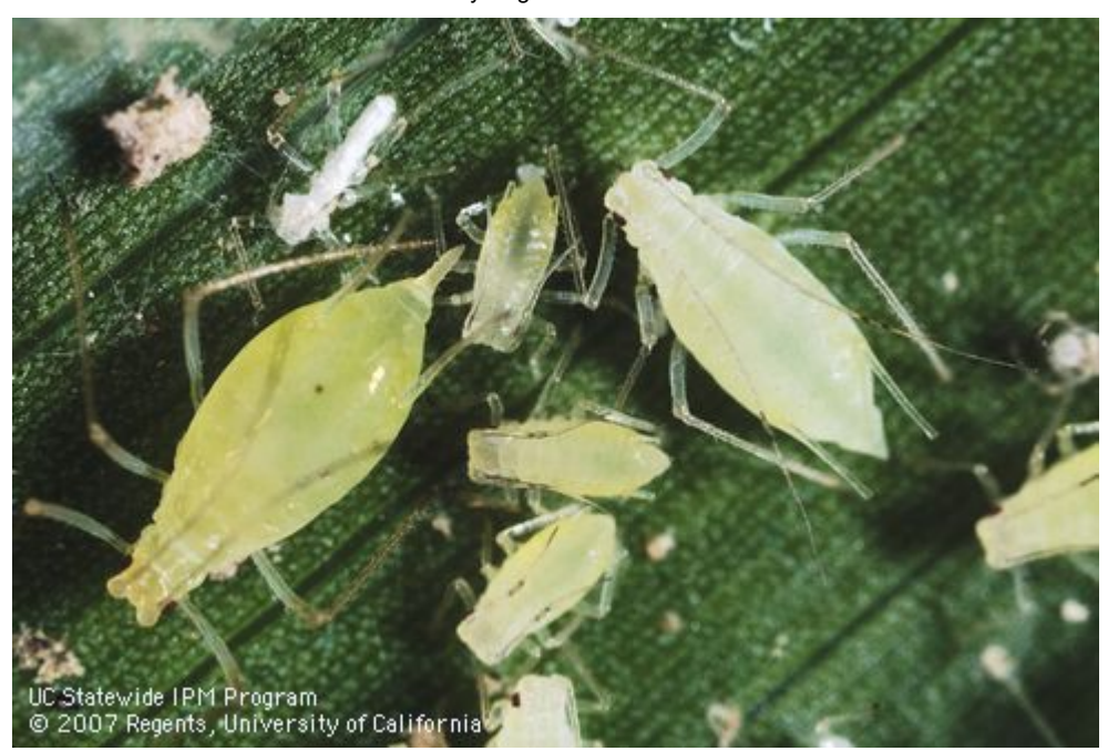
What's Bugging Your Garden?

The University of California <u>Integrated Pest Management (IPM)</u> program has a great website for controlling garden pest problems with the least impact on people and their surroundings. Whether it's fungal, insect or vertebrate pest, you can find some answers.