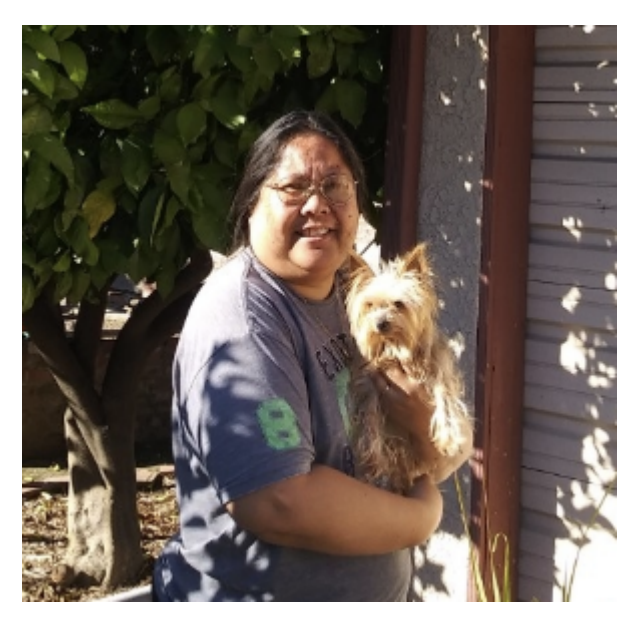
Monthly Master Gardener Spotlight